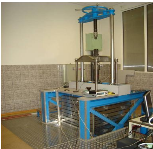
Fig. 2. 100 kN dead weight force standard machine of INM.

The values of measurements and the associated uncertainties, estimated in accordance with international standards, norms and procedures, were stated by each laboratory as part of the calibration report.