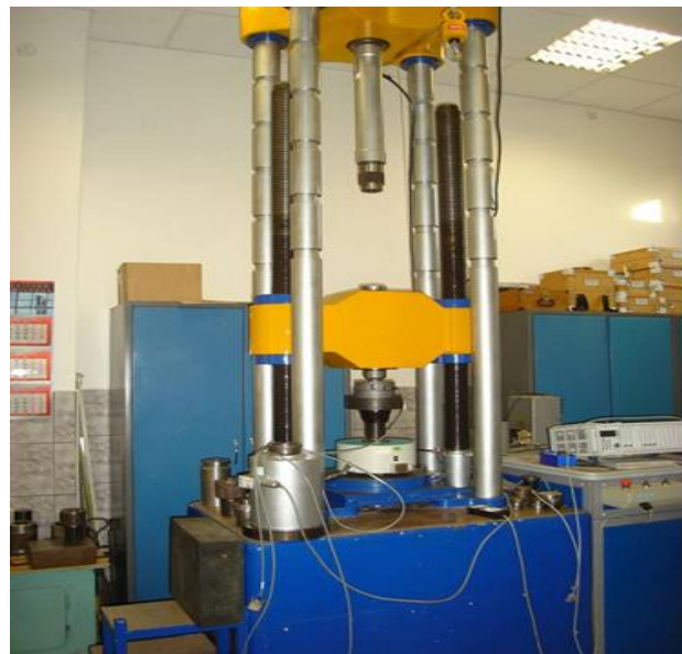
Fig. 3. 1000 kN force standard machine with reference transducers of INM.